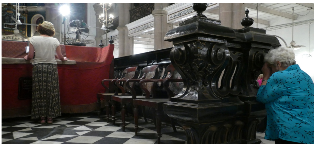
Rahel leading a service in Calcutta.

Please join us on this unforgettable adventure!